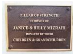
12 x 12 Bench Plaque

Purchase online at www.mpmamemorial.com or fill out the Purchase and Order Form on the following pages.